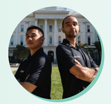
NEO Escape Rooms 2018 Winner

Wrapping its sixth year of competition, Calling All Dreamers helped another class of entrepreneurs to realize their dream of opening a business in downtown Sacramento. Finalists received business coaching and the winner, NEO Escape Rooms, won a start-up package valued at more than $100K with the resources and tools needed to start off on the right foot.