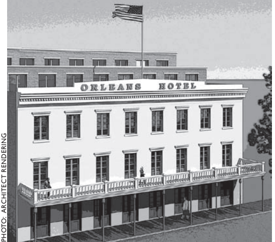
PHOTO: ARCHITECT RENDERING

For more information about the loft units or retail space, call (916) 852-2770 or visit oldsacproperties.com .