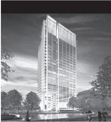
U.S. BANK TOWER

2008 should be a busy year of ground-breakings and ribbon cuttings in Downtown Sacramento. Here are some of the projects that are expected to be delivered in 2008: